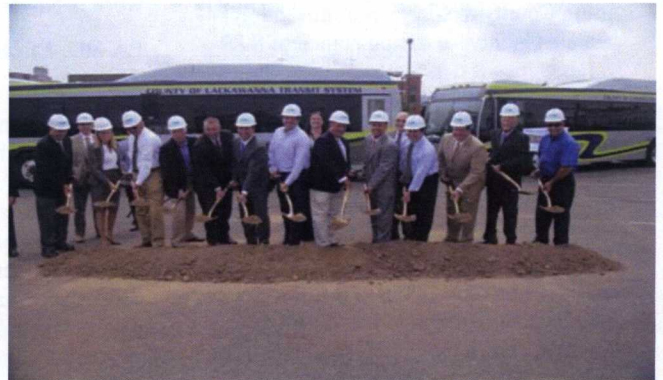
Groundbreaking Ceremony for COLTS Downtown Intermodal Hub

Construction of the Downtown Transportation Hub is slated to be completed by the fall of 2015.