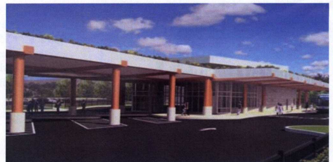
Artist's Rendering of the outside of the Downtown Intermodal Hub